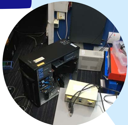
This was the new hardware being installed!