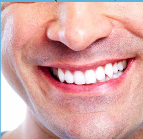
Dental Implants to improve your smile