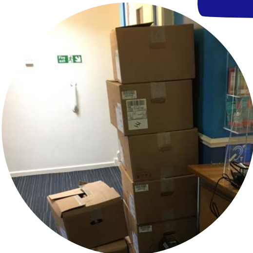
This is a picture of when the new hardware was delivered!