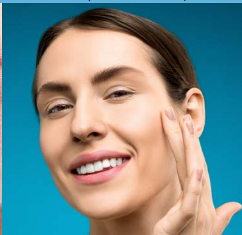
We can help your face smile as well as your mouth! See inside for further details